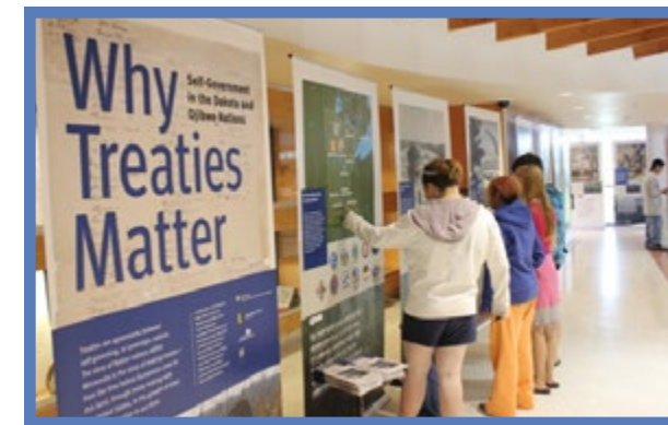
"Why Treaties Matter: Self-Government in the Dakota and Ojibwe Nations" exhibit.