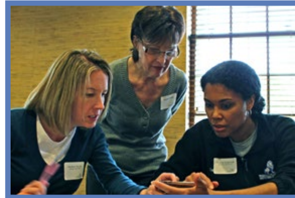
Educators at a professional development workshop.