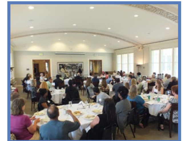
June 2012 Lunch and Learn event.