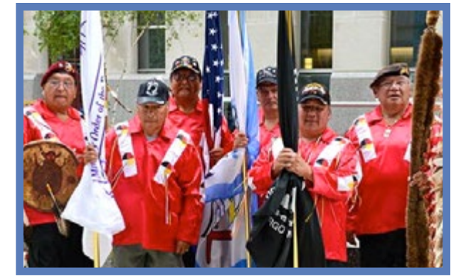
"Why Treaties Matter" opening ceremony at Mayo Clinic.